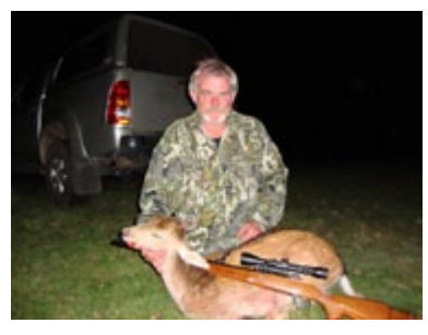
Dog_Gone - My first deer

To see many more images, comments and descriptions, check out the <u>member's gallery</u>.