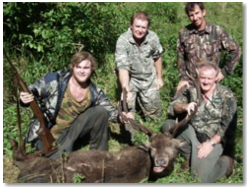
Red stag