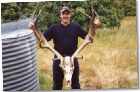
Back in NZ by Wapiti