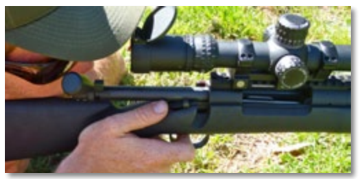
90 deg on the trigger ensures it gets squeezed straight back.

A firearm vibrates briefly when discharged. If we pull the trigger in any direction, rather than squeezing it straight back, we are effecting the natural vibrations of the firearm. This can affect our point of impact, our natural point of aim and ability to accurately make follow up shots.