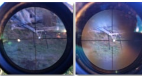
Edge to Edge clarity

When taking a sight picture through a scope, the firer should have a clear, crisp sight picture without shading. If there is any shadowing or blurriness the scope needs to be either adjusted or its position on the firearm to allow a clear, crisp image to be seen through the scope.