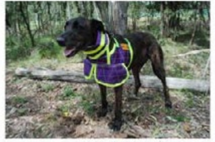
Now Available!!! Duncan's Pigdog Collars

Address: Shop 10/3238 Mt Lindesay Hwy Browns Plains QLD, 4118