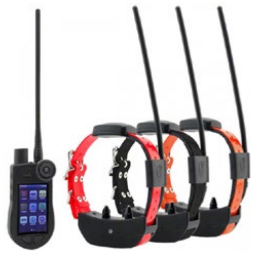
TEK SERIES 2.0 - GPS Tracking and Training System

Our product development processes and customer service support show that we are committed to making sure that you get